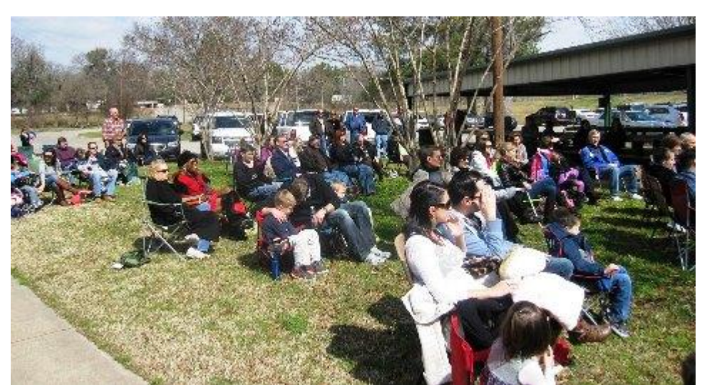
Dellwood Park - Mt. Pleasant, Texas

Message to America-The Name of Jesus. On February 25<sup>th</sup> I recorded an audio message, stating that it was "...a message to my country," and I prayed America would humble themselves and hear what God was saying. You can find it on my website.