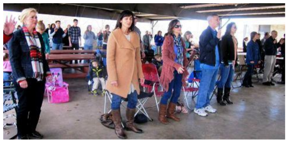
Navasota Praise and Worship

At the beginning of our worship, it was difficult with much pressure, so much so that my feet were numb. Before it was over, I broke through and all the numbness left.