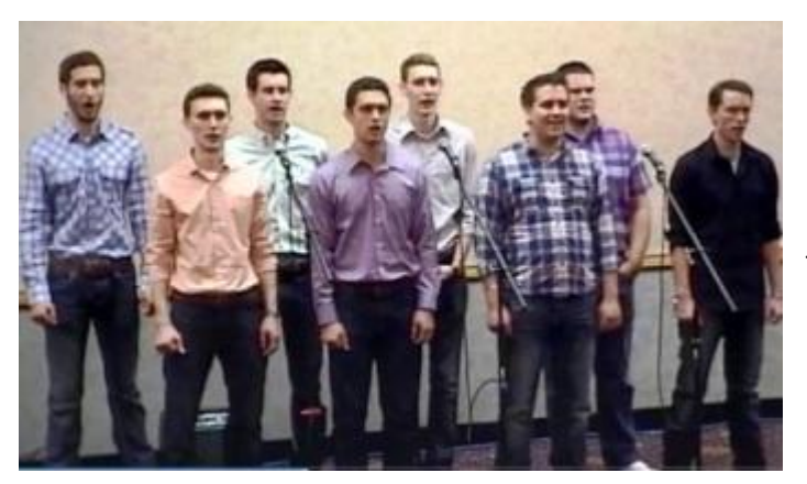
Eight of the Water of Life Boys ministered in Joplin.